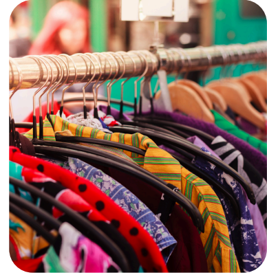
EXHIBIT WITH US