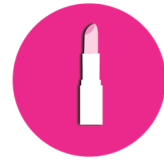
EXHIBIT WITH US NOVEMBER 7