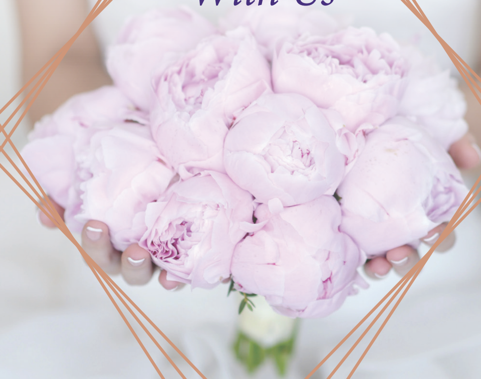
Exhibit With Us