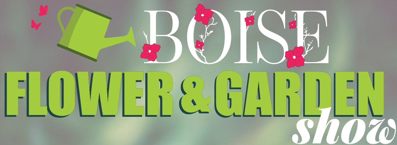
EXHIBIT WITH US