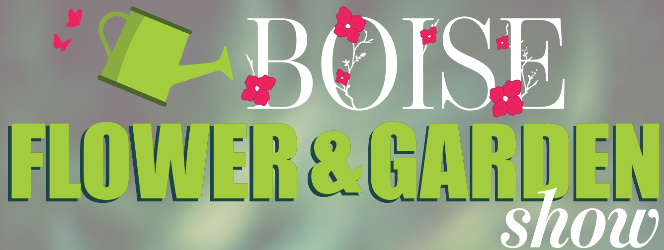
EXHIBIT WITH US