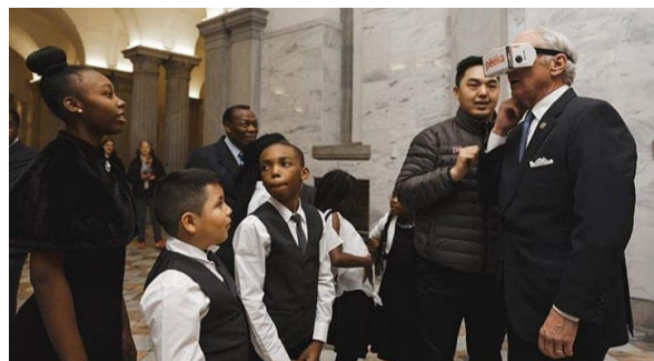
Governor Henry McMaster trying out PeekavR's first VR book (above)

Now, Peeka is also working with schools in the Nampa School District (in Idaho), as well as doing specialized work with specialized schools for students with learning disabilities (e.g. dyslexia).